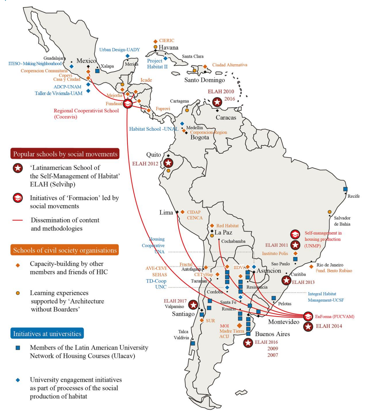
Figure 1. Schools of HIC-AL [Adapted from HIC, 2017, p.143, complemented by interview data. Note that this map does not claim to be comprehensive of all schools (Authors' translation)]

Through fieldwork and multiple conversations with regional representatives of HIC-AL, we have identified that these schools have a variety of foci towards strengthening capacities for the social production of habitat. Although not intended to be a comprehensive or mutually exclusive typology, schools seem to foreground one or more of the following objectives: