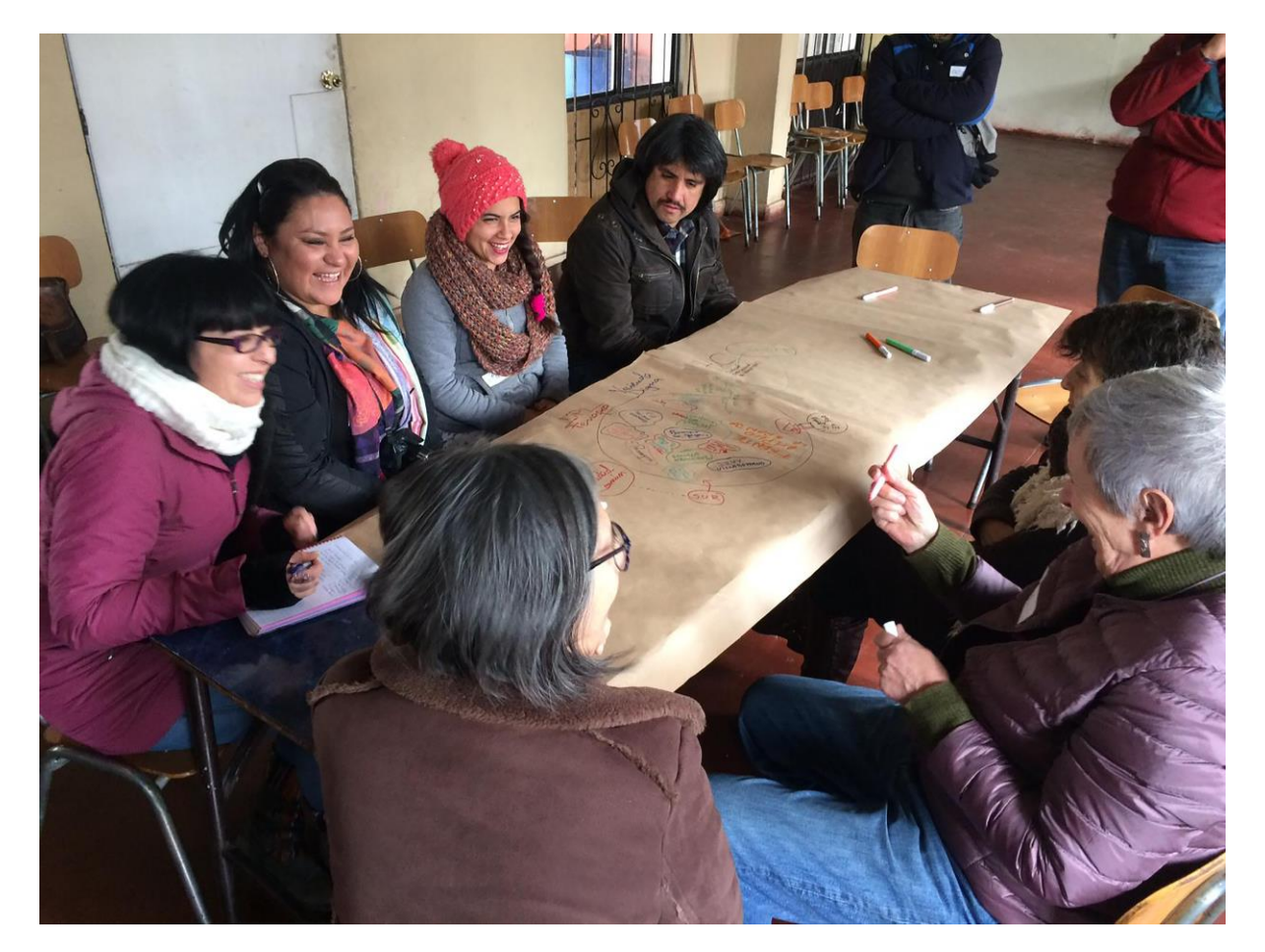
Figure 2. Grassroots pedagogies at work in the School of La Granja, Chile. (Adriana Allen, 2019)

The contextual responsiveness of the schools is also reflected in the shared pedagogic principle of openness of the curriculum, which is sensitive to particular situations. Many schools start by covering basic contents around the right to the city and the social production of habitat to build a shared language. From that basis, the schools' 'curriculum' is fundamentally built around its purpose, be it learning to resist eviction threats or to develop a housing cooperative. This implies that learning is approached as a process of formación de haceres y saberes , where the collective construction of ways of knowing are inseparable from those of doing.